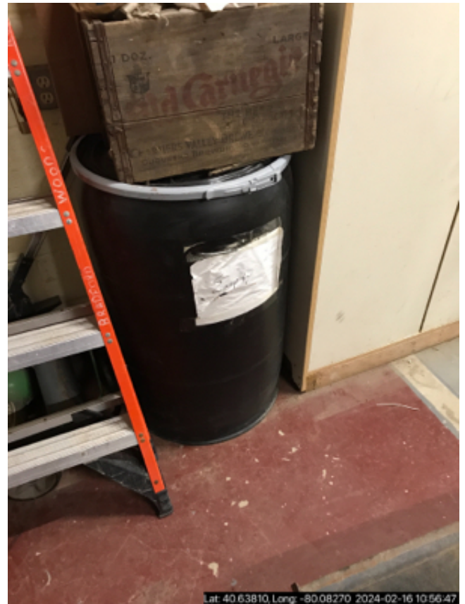
Photo #: 10 Operations (Field)-004 Description: spill kit