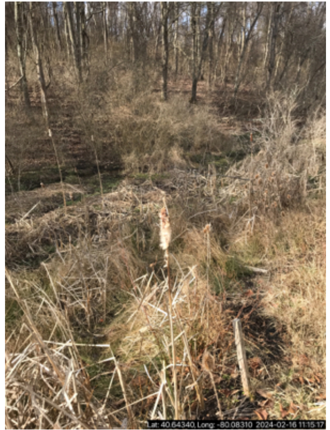
Photo #: 10 Operations (Field)-004 Description: Woodlands Foundation outfall