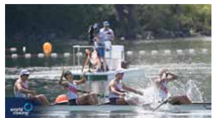
Team USA crossing the finish line.